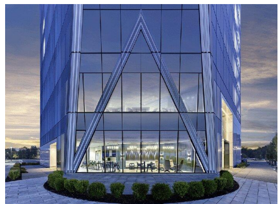
Morris James has moved its headquarters to a mixed-use campus on Avenue North Boulevard in Wilmington, Delaware. The new office — which is in north Wilmington rather than downtown, like the firm's former headquarters — has upgraded features and more conference room space.